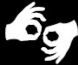
Sign Language Interpreters

Please ask the front desk for more information or to request communication assistance.