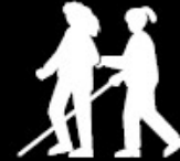
Support Service Provider